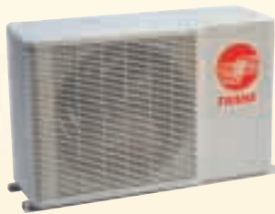
TTK512 - TTK060 12,000 - 60,000 BTUH

* The choice of HORIZONTAL or VERTICAL air discharge allows for the selection of the best unit for different outdoor spaces.