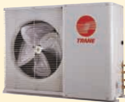
MTK518 - MTK536 18,000 - 36,000 BTUH

* The option of a Trane MULTI-SPLIT system allows two or three mini-split indoor units to be matched to a single outdoor unit.