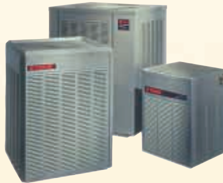
TTB012 - TTB060 TTR030 - TTR060 TTB512 - TTB536 12,000 - 60,000 BTUH

* The option of a Trane MULTI-SPLIT system allows two or three mini-split indoor units to be matched to a single outdoor unit.